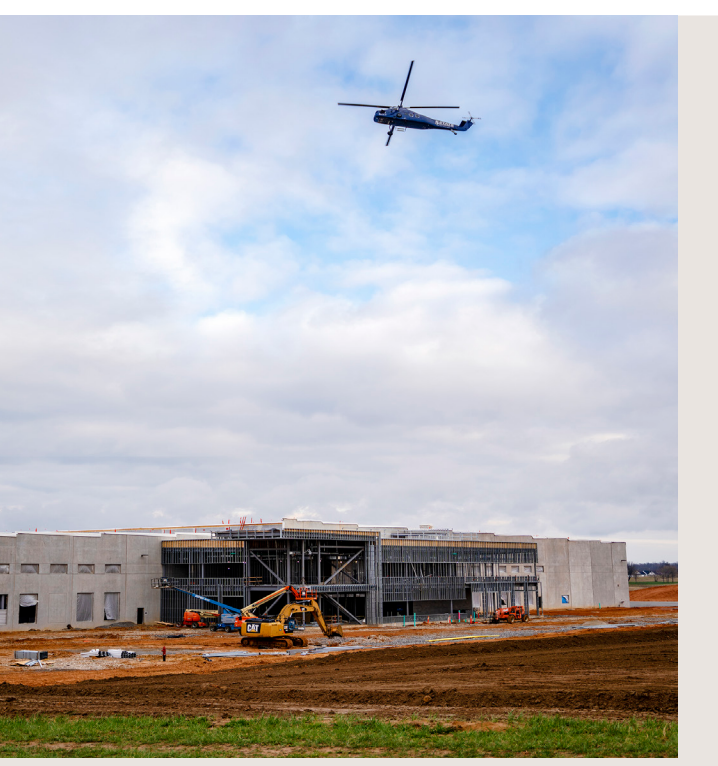
"Kruger Packaging has come in and really made a stir in Elizabethtown."